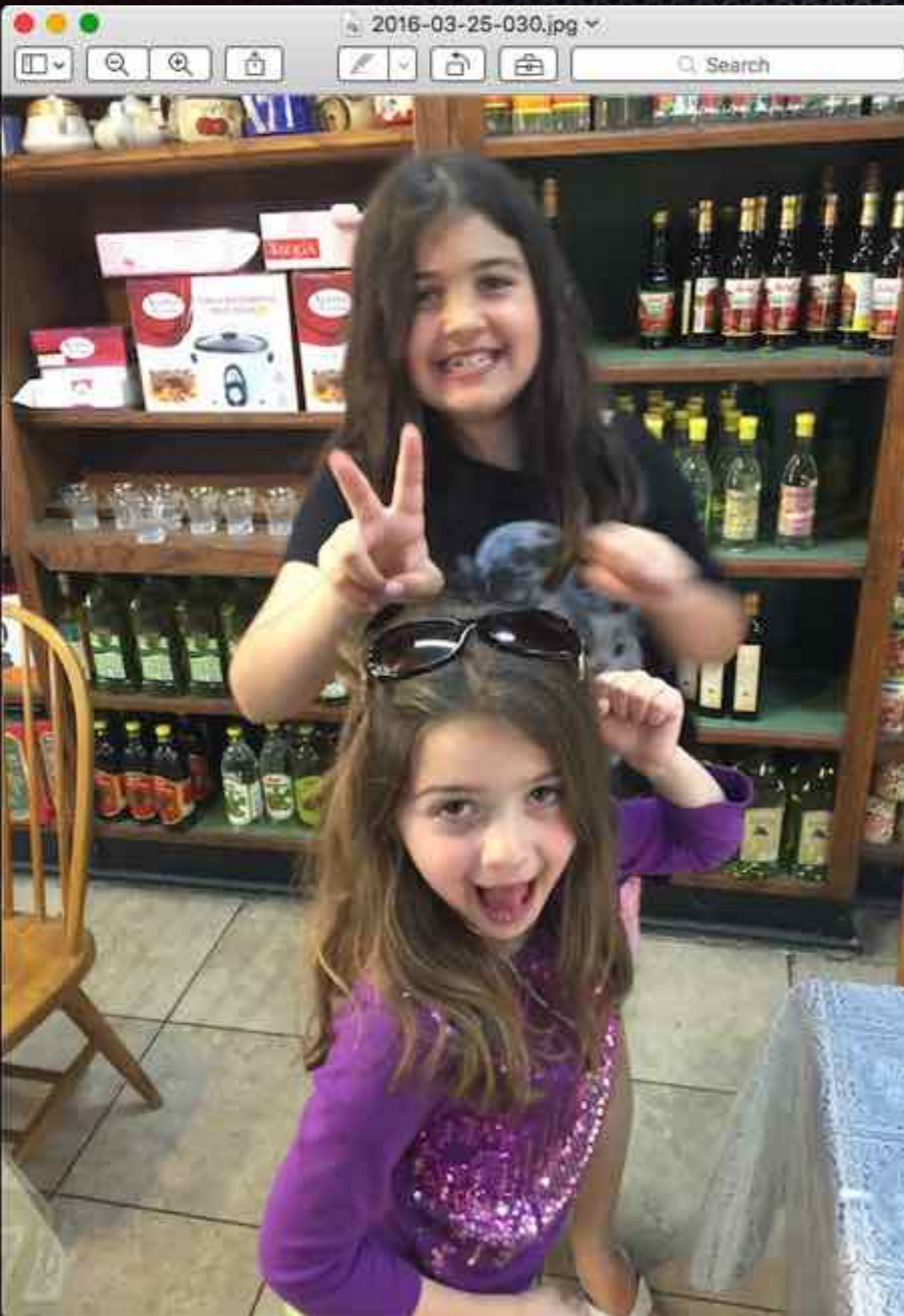
Photo Metadata Standards